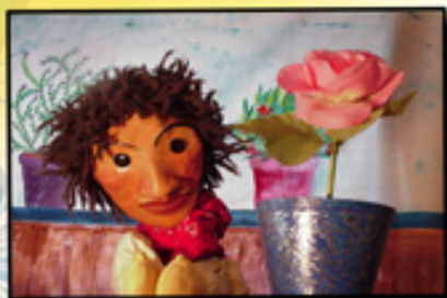
This is Manito. He is the main character in the story of "The Gardener"