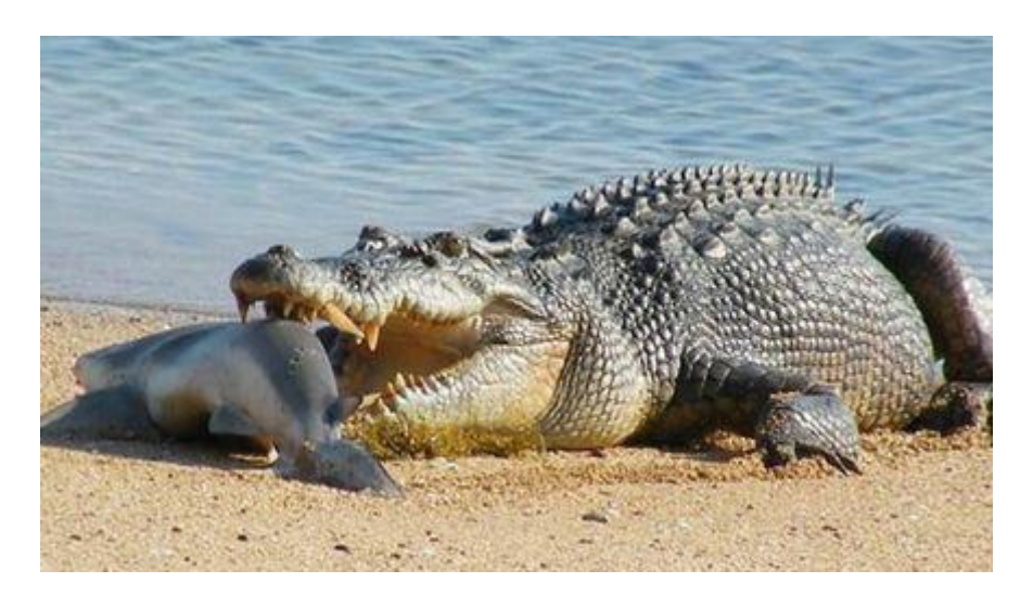
saltwater crocodile – world's largest members of the crocodilian family; can reach 20+ feet in length and is extremely ferocious; almost hunted to extinction before becoming protected species in 1972; smaller and much less dangerous freshwater crocs which are can also be found Down Under.