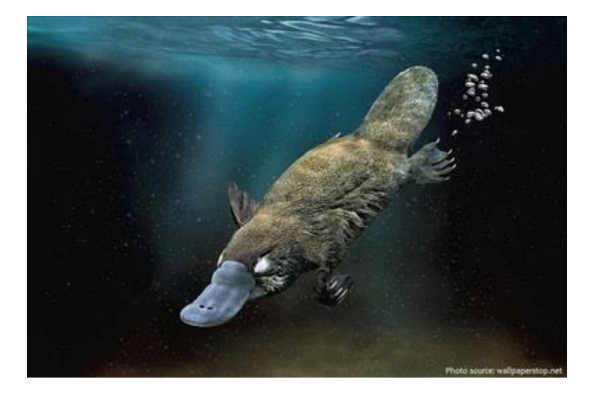
platypus – one of only three egg-laying mammals on earth, it has a bill and webbed feet like a duck and waterproof fur like a seal; the male has venomous spurs in its hind ankles; walks with a lizard-like gait; has been around since the time of dinosaurs, more than 100 million years ago.