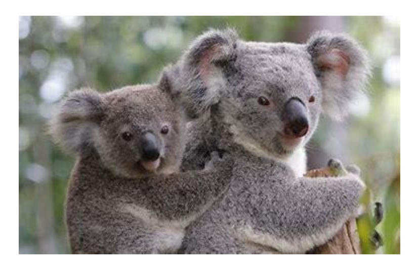
koala – marsupial that eats almost exclusively eucalyptus leaves; diet is so low in energy that it sleeps up to 20 hours a day and rarely leaves safety of tree; "koala" means "no drink" in certain Aboriginal languages, because koalas obtain most of their water from eucalyptus leaves.