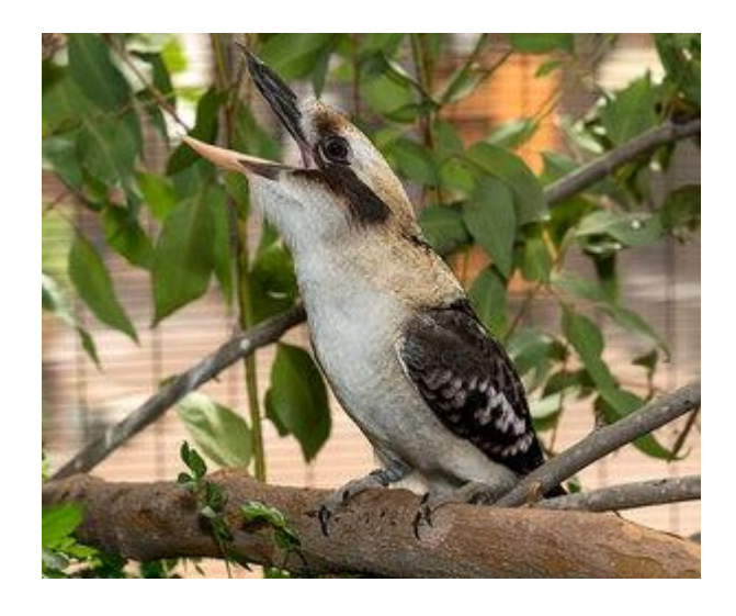
kookaburra – two species of this bird are the blue-winged kookaburra and the laughing kookaburra; the laughing kookaburra is the better-known and is often heard letting loose a loud, chuckle-like call.