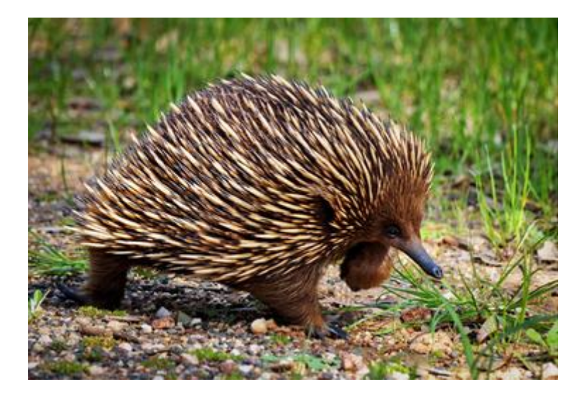
short-beaked echidna – also known as spiny anteater; one of only three species of egg-laying mammals, called monotremes (others are platypus and long-beaked echidna).