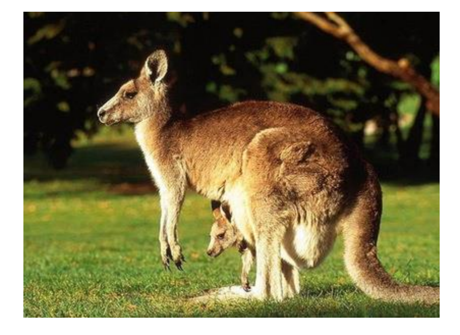
kangaroo – more than 40 species of this marsupial live Down Under, from small tree kangaroos (13-16 pounds), to the red 'roo, which can be as tall as a man and weigh 180 pounds.