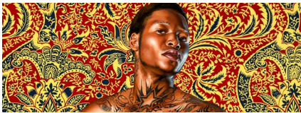
Kehinde Wiley, Prince Albert, Prince Consort of Queen Victoria, 2013