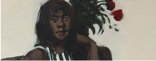
Lynette Yiadom-Boakye, 6pm Madeira , 2011.